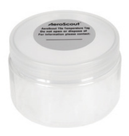
T5a Tag Temperature Stabilizing Container (SKU: TAC-500)